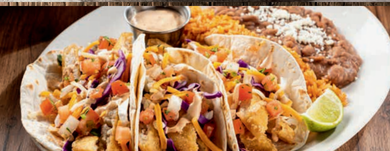
DOS XX® FISH TACOS