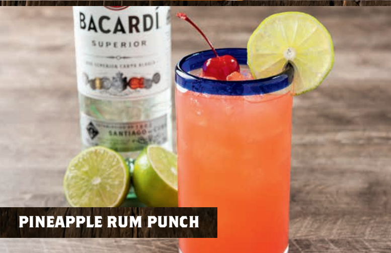
PINEAPPLE RUM PUNCH