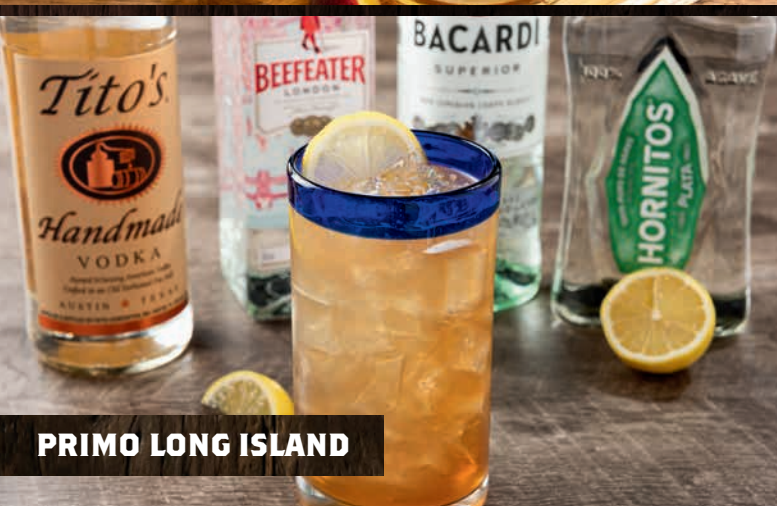
PRIMO LONG ISLAND