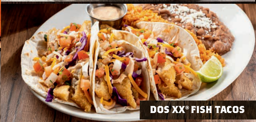
DOS XX® FISH TACOS