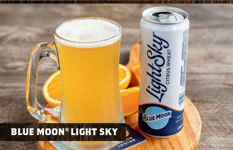
BLUE MOON® LIGHT SKY