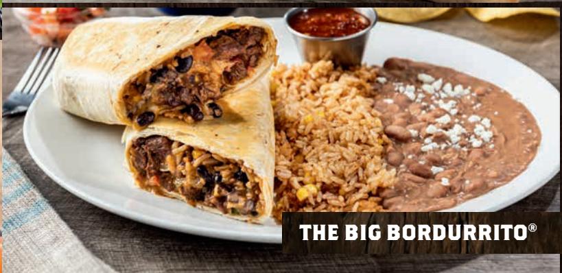
THE BIG BORDURRITO®