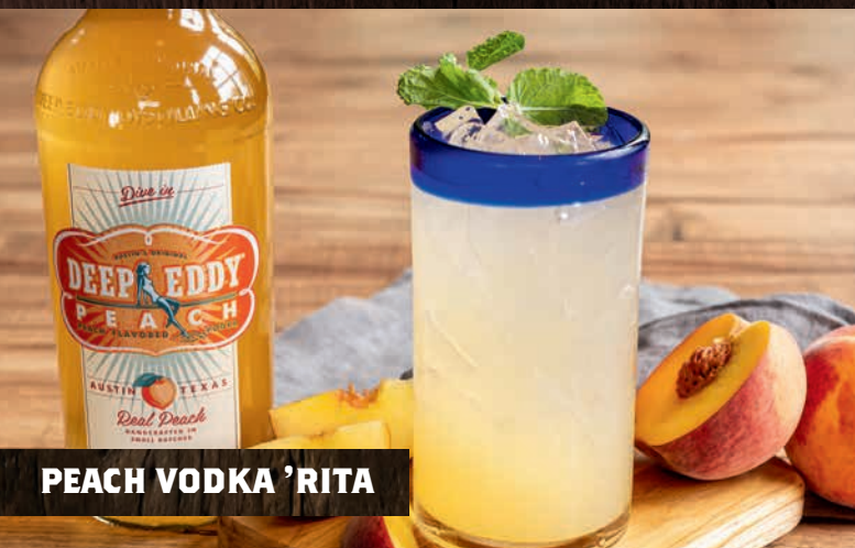
PEACH VODKA 'RITA