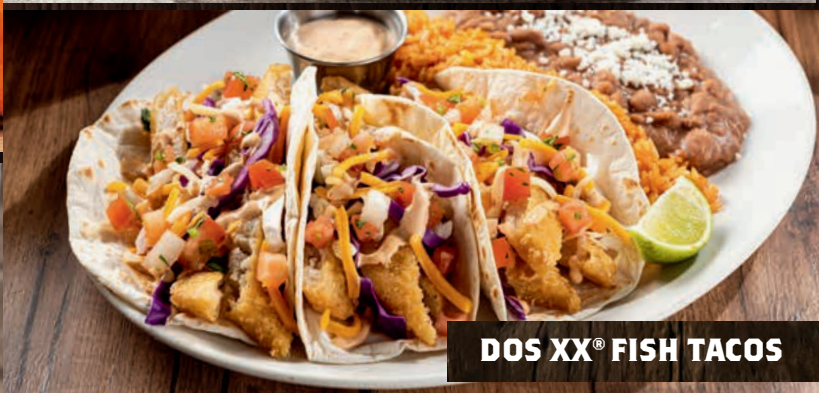
DOS XX® FISH TACOS